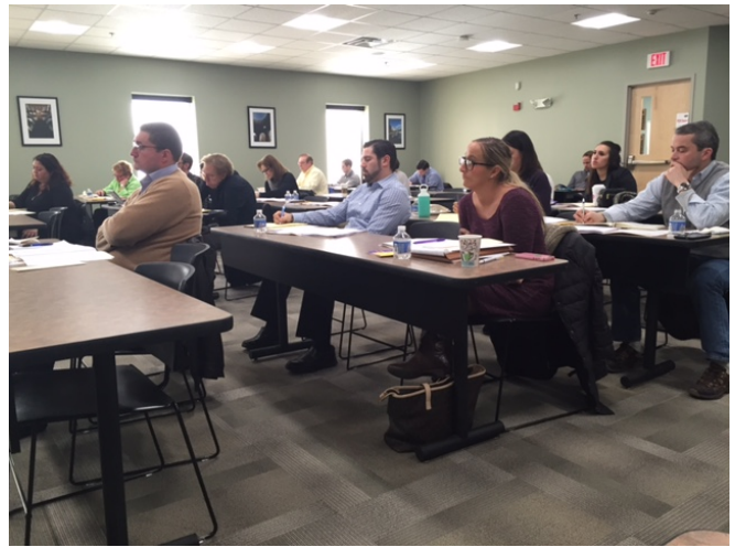
PODV First Class