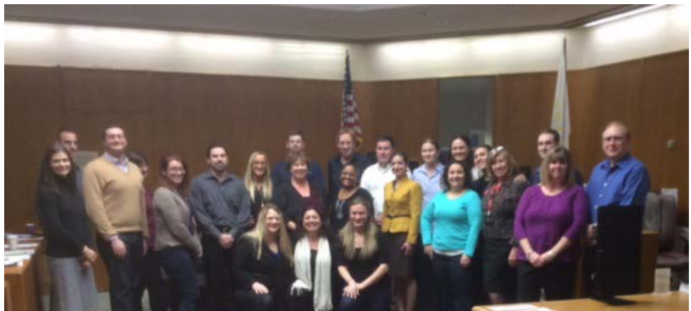
Volunteer Mentors from the first PODV class

Divorce and custody/visitation cases involving issues of domestic violence are identified by the Rhode Island Bar Association's Volunteer Lawyer Program (VLP), and referred to the PODV. Upon referral into the program, the case is assigned to a volunteer legal team, which consists of an experienced family law attorney, who will closely mentor a pair of volunteer attorneys, as they provide individual representation to the client. Each client will also be referred to a domestic violence advocate who will be available to provide critical support services and safety planning.